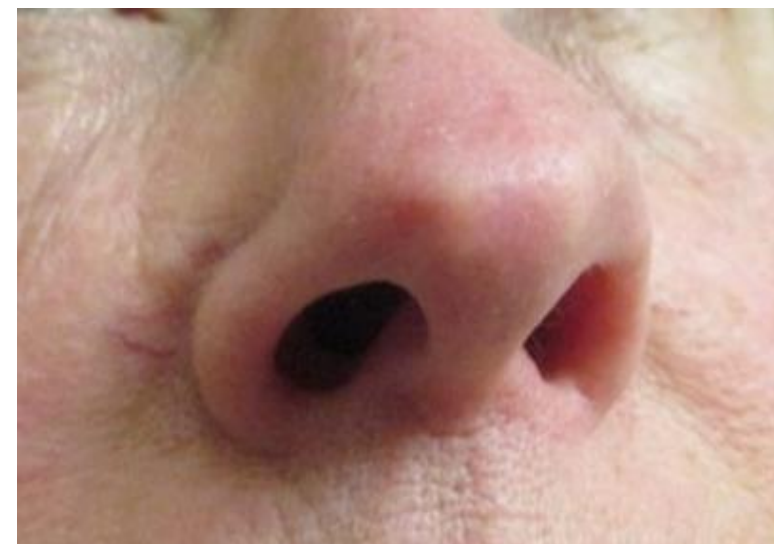
1 month follow up