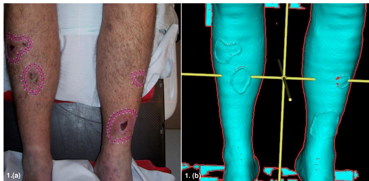
Figure 1: (a) Initial simulation for applicator design, with radiopaque wires outlining the CTVs. Two lesions on the right shin were combined into one, resulting in two CTVs per shin. (b) Body contour that was used to model the applicators for 3D-printing. (c) Applicator and catheter trajectory model for the right shin in 3D Bolus.